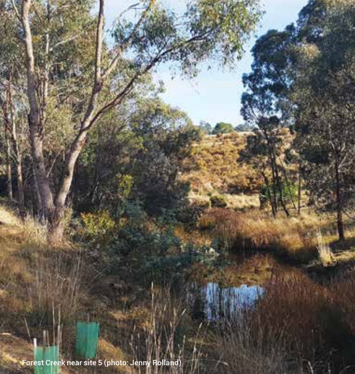
Forest Creek near site 5