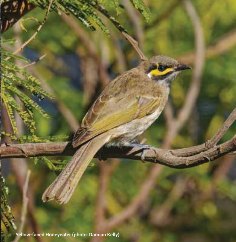
Yellow-faced Honeyeater